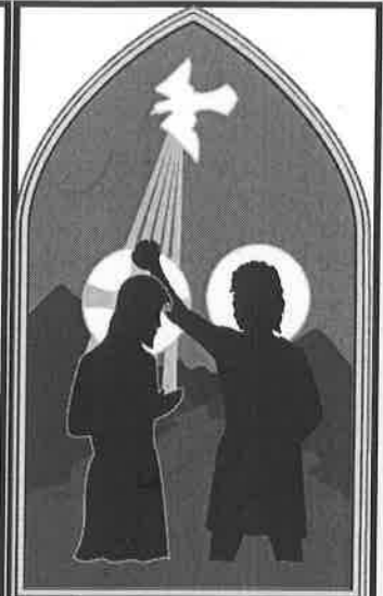
The Baptism of Our Lord

To apply: Monasterevin Community Employment Scheme Parish Centre Monasterevin Tel. 045 525143